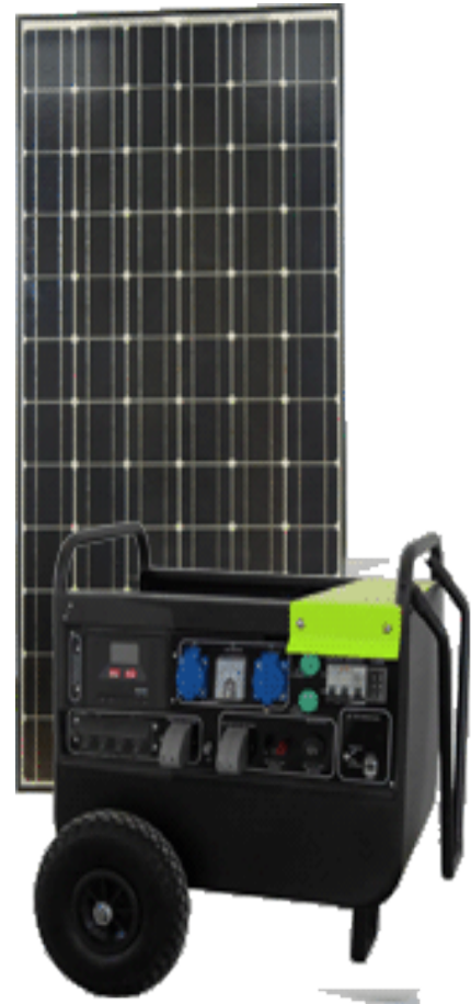
PORTABLE 3000 WATTS